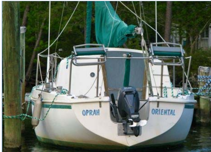
A few years ago, there were rumors that Oprah Winfrey would be buying a home in Pamlico County. It can now be confirmed that "Oprah" does spend time here, on Green's Creek.

MR. MARCH 2010 - RAMADI: Iraq War Veteran With Four Legs. Pet Of The Month